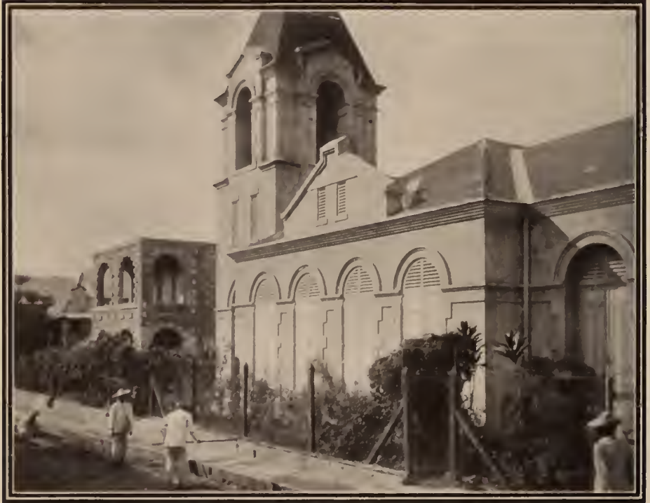
THE PRESBYTERIAN CHURCH AND MANSE AT AGUADILLA, PORTO RICO